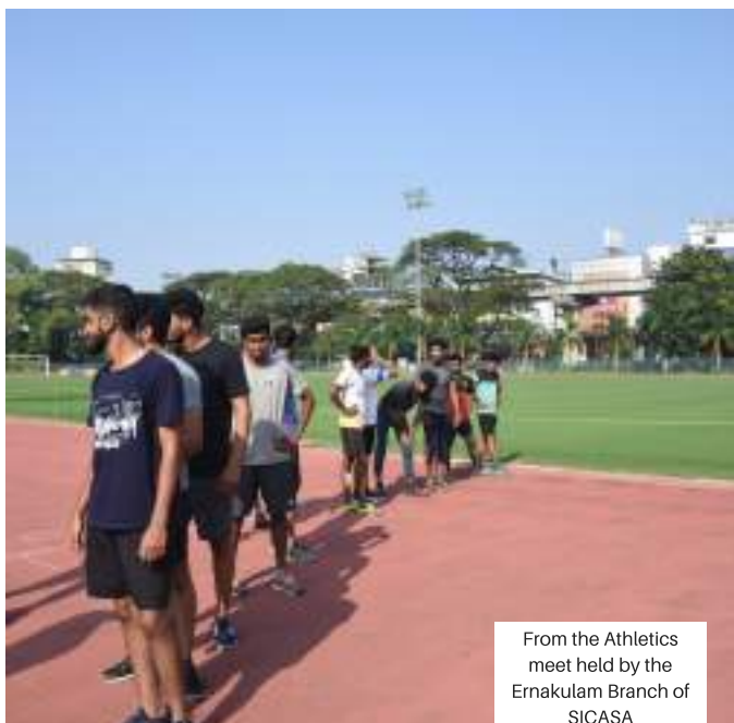
From the Athletics meet held by the Ernakulam Branch of SICASA

Now let us take a look at a few memories from our sports events during the year.