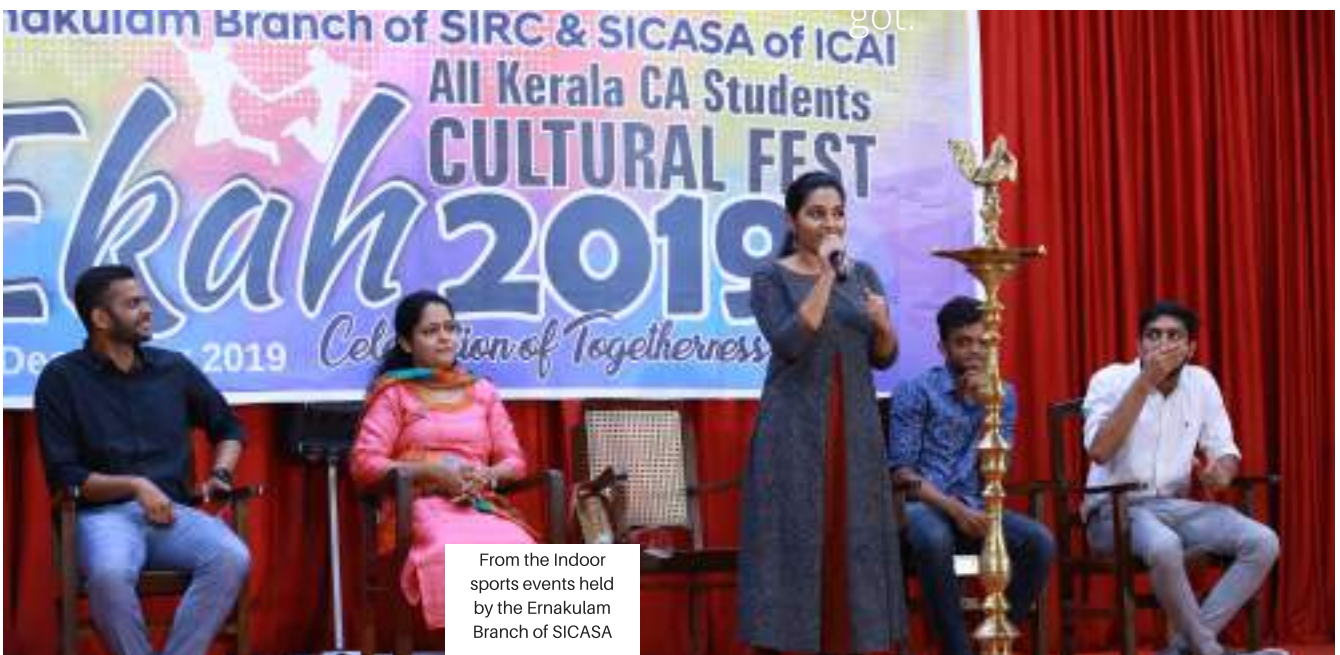
From the Indoor sports events held by the Ernakulam Branch of SICASA