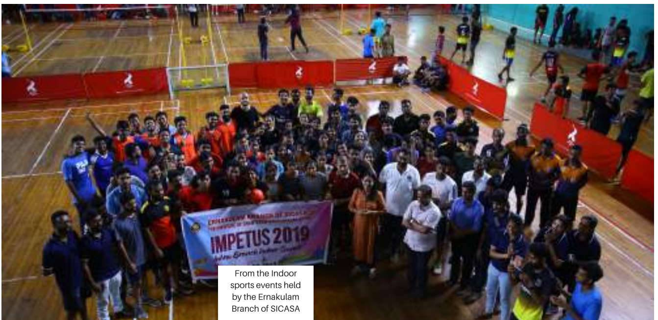
From the Indoor sports events held by the Ernakulam Branch of SICASA