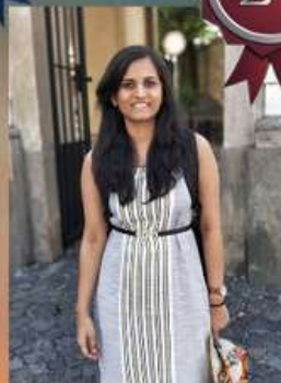
RUJVI A SARAF SRO0611049