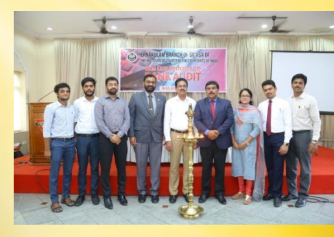
From the seminar on bank audit, held on March 19th