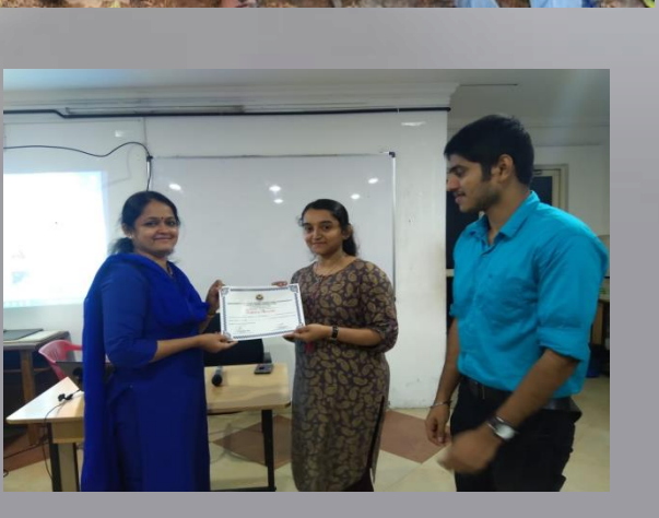
◆ From the study circle on 17/10 ▶